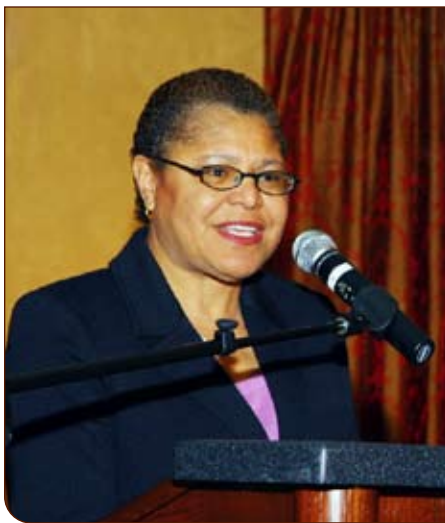
California State Assembly Speaker Karen Bass delivers a keynote address at the 16 th Annual California Policy Issues Conference