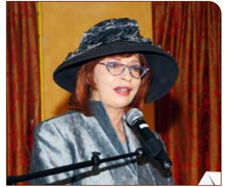
Patt Morrison of the LA Times and KPCC 89.3FM addresses conference participants as the morning keynote speaker at the 16 th Annual California Policy Issues Conference

Los Angeles Times columnist Patt Morrison delivered the morning keynote address. Ms. Morrison focused on state and local election results and addressed implications for the state’s economy and its social fabric. California Assembly Speaker Karen Bass was the luncheon keynote speaker. Speaker Bass elaborated on the state’s economic condition by focusing on California’s fiscal and governance structures, particularly on the existing archaic systems that impede the timely passage of the state budget. She highlighted one particular impediment—the required two-thirds majority vote needed to pass the state budget—and said it is no longer manageable or appropriate for California in the 21 st century. Speaker Bass called for budget reform and accountability in order to secure a better quality of life for all Californians.