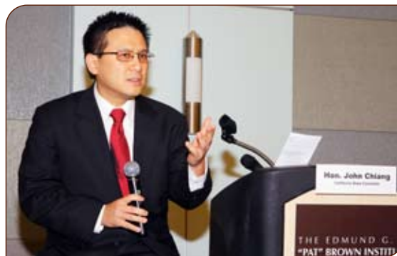
California State Controller John Chiang addresses the audience at The California Agenda lecture "California's Financial Future: Getting Beyond Gridlock"

Featured Speaker: California State Controller John Chiang.