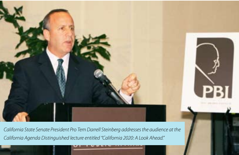
California State Senate President Pro Tem Darrell Steinberg addresses the audience at the California Agenda Distinguished lecture entitled "California 2020: A Look Ahead."

The California Agenda series is traditionally focused on significant regional and statewide public policy issues. For 2010, the California Agenda focused on the City of Los Angeles and the Los Angeles metropolitan area, with an emphasis on the region's most pressing issues, especially in terms of the intersection of social justice and equality of opportunity.