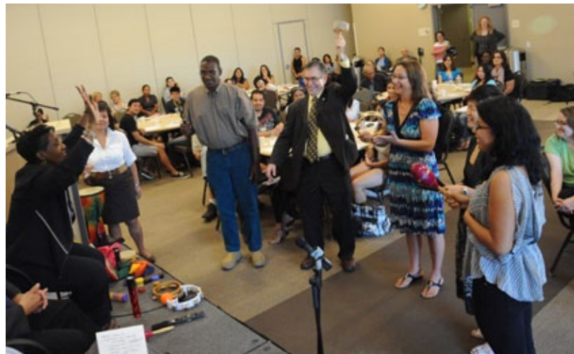
The "Mental Health is Everyone's Business" forum featured the therapeutic benefits of music.