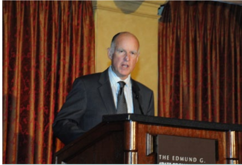
California Governor Jerry Brown during his keynote address at the 30 th Annual Awards Dinner.