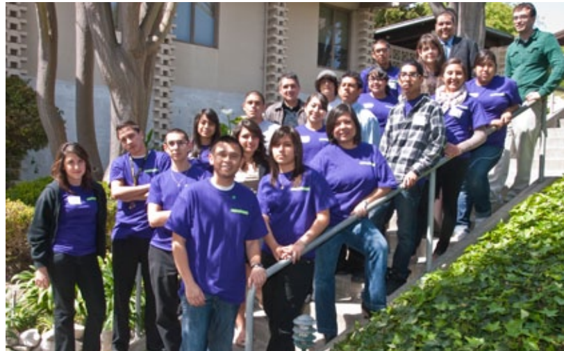
The inaugural Youth Civic Engagement & Leadership Training Class included students from Roosevelt, Lincoln, and Locke high schools, and Huntington Park College-Ready Academy.

Culturally Sensitive Interventions for Grandparents Raising Grandchildren