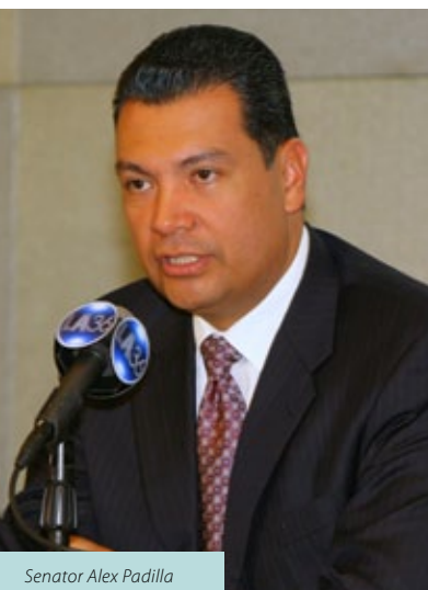
Senator Alex Padilla